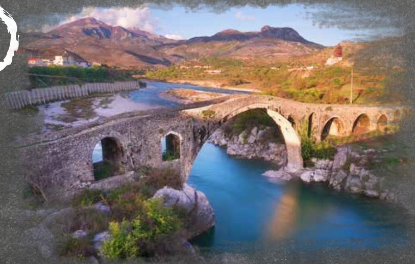
The Old Mes Bridge in Shkoder, Foto: adonis_abril, Fotolia

Obtaining residence permits in Albania is regulated by the Law on Foreigners (National Gazette No. 74/16)